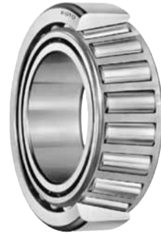
Koyo长寿命KE轴承 Koyo EXTRA-LIFE Bearing (KE)